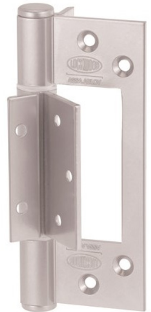
Clear Anodised AH130CAN