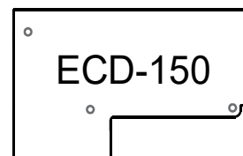
100 mm apartment door sill