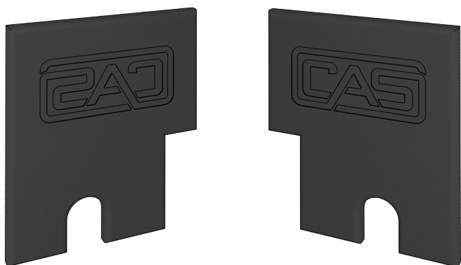
LB5 -R Right

The LB5 End Cap is designed to reduce air infiltration through covering cropped area and machining details. These endcaps are the perfect final touch towards perfect presentation of your apartment doors.